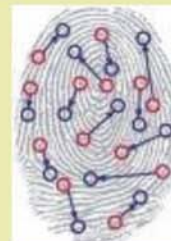
Biometric Attendance System